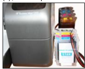
Put the CISS on the left side of the printer, in the same time order all the tubes in the correct position