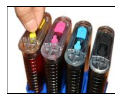
Pull up the rubber plug in the air hole.